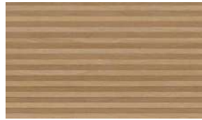
Deco Bremen Roble Natural 31,6x90