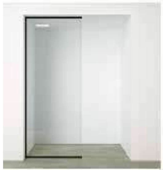
Tec Round thermostatic black matt column matt black optimal screen