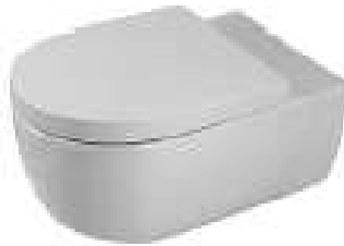
INO. ACRO COMPACT SUSP. RIMLESS 54CM