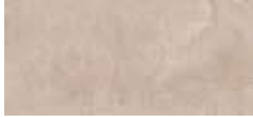
Persa Natural 31,6 x 90