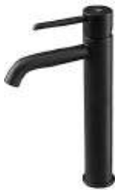
MONM. Round Caño alto 306 mm BLACK