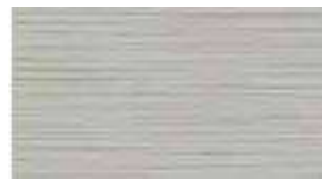
Limit Persa Silver 31,6x90