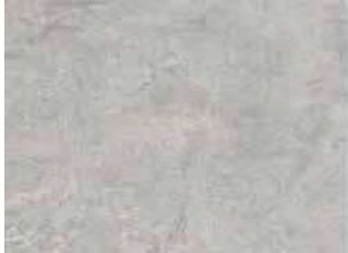
Persa Silver 100x100