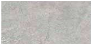
Persa silver 31,6 x 90