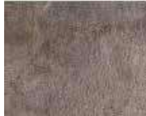
Airslate Delphi BTP 250x120