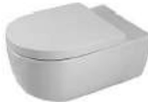
INO. ACRO COMPACT SUSP. RIMLESS 54CM