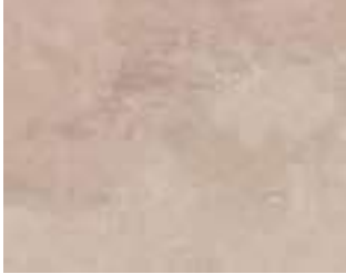
Persa Natural 100x100 Persa Natural 31,6 x090