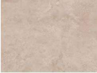
Persa natural 100x100