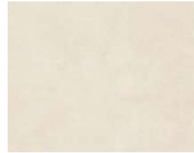
Vela Natural 100x100