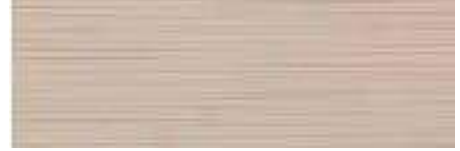
Limit Persa Natural 31,6x90