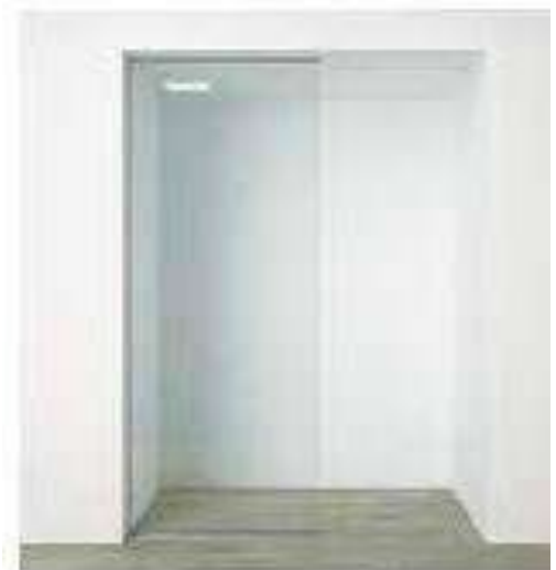
Tec Round thermostatic chrome column optimal screen chrome